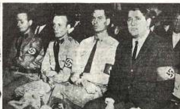
George Lincoln Rockwell [second from right] and three members of his American Nazi Party are listed witnesses in the International Amphitheatre. They attend Black Muslim organization's last major rally of 1962.