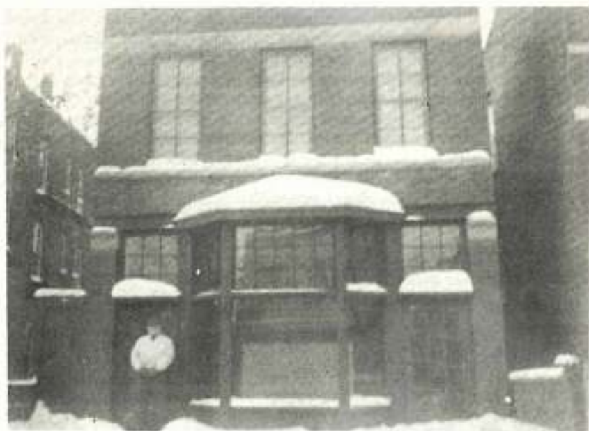
Party Headquarters at 2124 N. Damen Street, Chicago,