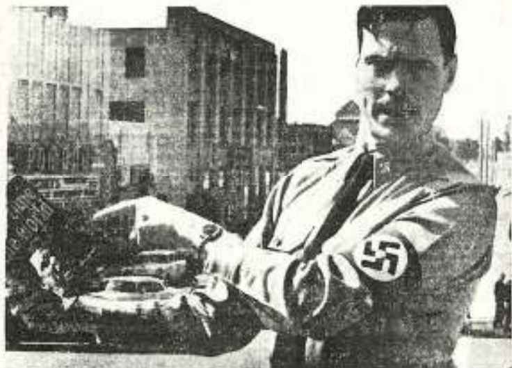
"TOMORROW THE WORLD" —Self-styled "Fuehrer" of American Nazi Party, George Lincoln Rockwell, points in his recent book on party's aims. Rockwell is in Pomona on week-long visit to organize Nazi Party in Los Angeles area. Rockwell

At the press conference the next day I was able to get a tremendous amount of truth into the papers and TV and other media of Los Angeles, which must have awakened a great many people as to what it is we are really trying to preach and do.