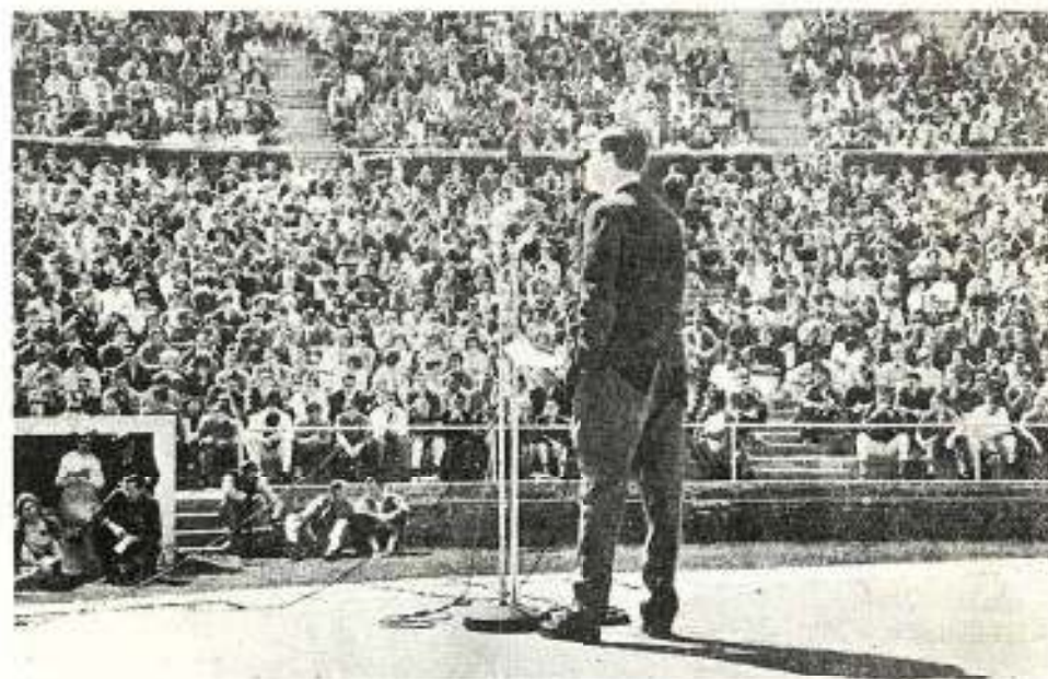
Part of the huge crowd in the Amphitheater listening to the damning facts about the Jew-Communist conspiracy against America and the White Race; San Diego State College, San Diego, California.

BUT IT IS IMPOSSIBLE TO IGNORE THE MASS AND MOB ACTIONS WHICH ARE THE JEWS' ONLY REPLY TO OUR PUBLIC EXPOSURES OR TO IGNORE OR MISUNDERSTAND THEIR IMPLICATIONS!