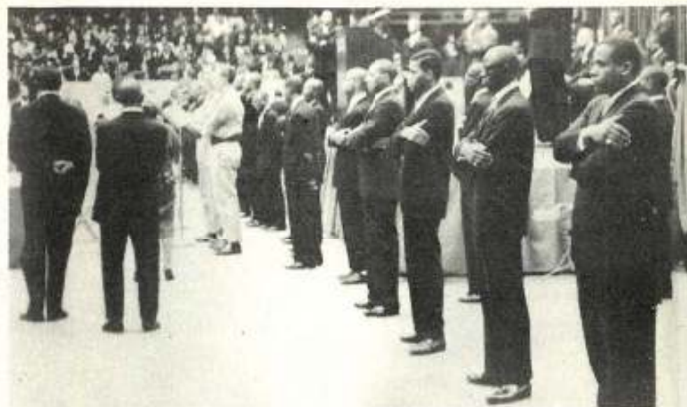
Commander Rockwell speaking at the Black Muslim convention, Feb. 1962

A great hush fell over the packed hall as he began to speak. Elijah Muhammad did not back away one inch from his support of the truth, regardless of who was preaching it. He said, "I take my hat off to any white man who wants to stay white! I do not want to be white! I want to be what I am! I do not want the white man's woman. I want my own woman!"